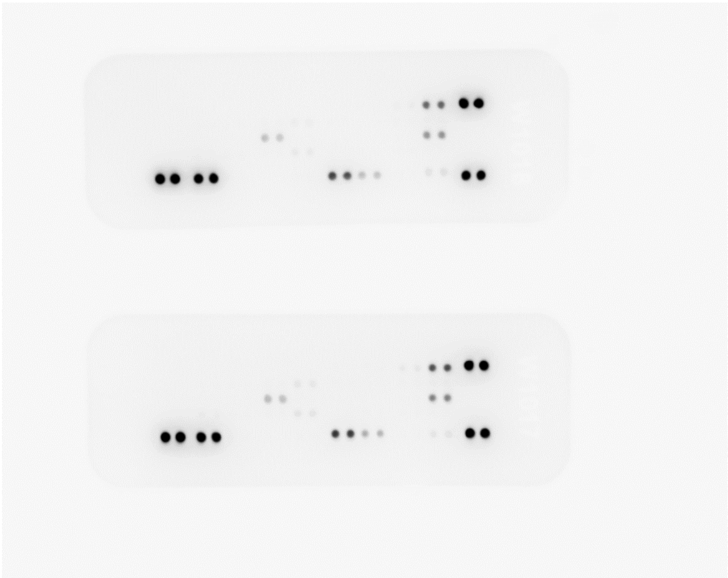
Cytokine array in BAFFsi